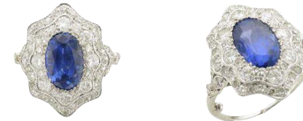
Not actual size

Comment Commentaire No indications of heating NTE Pas d'indication de chauffage * vB (23) 5/5 GEM Medium, strong, violetish blue Non-heated sapphires are scarce