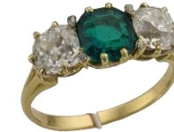
Not actual size