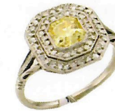
Faceted gemstone set on a ring with diamonds